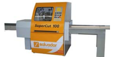
Supercut 100: new version