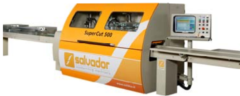
Supercut 500: now faster