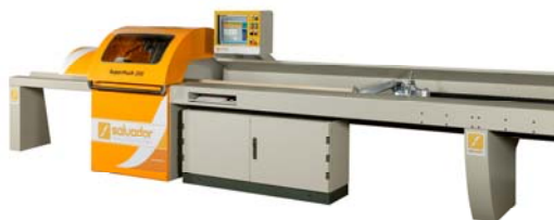
Superpush 200 Fast: New printer system